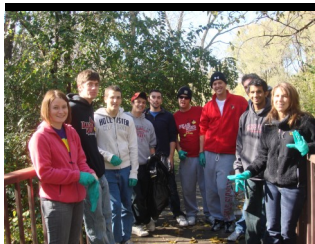
Gamma members cleaning the Hidden Creek Nature Sanctuary

On Friday afternoon October 29, Gamma members took some time away from studying to help clean up the community. The students met at the College of Business and gathered supplies of rubber gloves and garbage bags to begin picking up trash throughout the quad. They made their way over to the Constitution