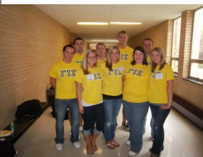
Gamma officers getting ready for a fun day at nationals

Nine of this year's officers ventured to Mt. Pleasant, MI, for Gamma Iota Sigma's 39 th Annual Management Conference. The event was hosted by the Nu chapter at Central Michigan University from October 1 st -3 rd . The sessions informed attendees about the professional insurance industry as well as Gamma Iota Sigma initiatives. Industry presentations ranged from discussions on catastrophe coverage and claim procedures to underwriting initiatives during hard and soft markets. The networking between other chapters really helped us brainstorm new and innovative ideas for the semester!