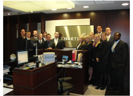
Gamma members visiting Chartis