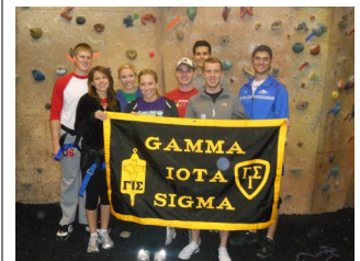
Gamma Iota Sigma members having some fun and team building while rock climbing at Upper Limits

They also cleaned the Hidden Creek Nature Sanctuary and began really getting their hands dirty as they cleaned up around the forest. It was a gratifying feeling for us to be able to go out and help the community in any way we can, and we also were able to enjoy a nice day walking the trail.