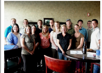
Gamma Iota Sigma members, enjoying a Peoria Chiefs game with RLI