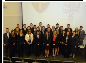
Gamma Iota Sigma members at the 2011 initiation, getting ready for a day of Gamma Games