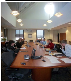
Students conversing over lunch with Liberty Mutual