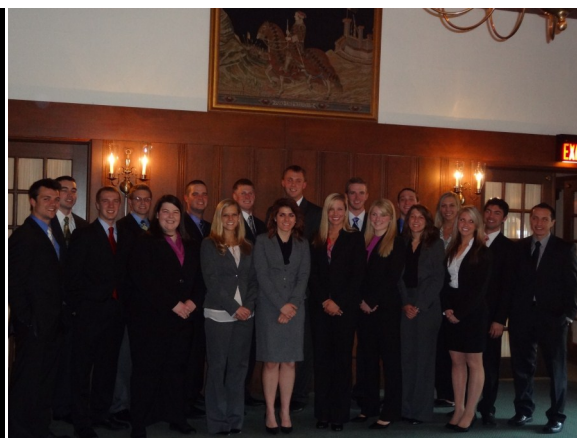
This year's and next year's officers at the transition dinner at Bloomington Country