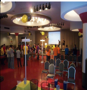
Teams anxiously waiting the updated scores between rounds of games at the Gamma Games