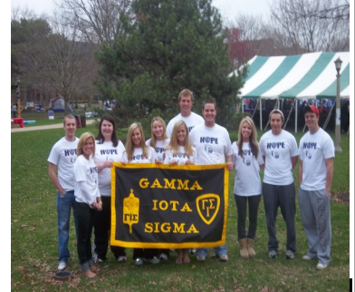
Gamma members getting ready for a night on the quad

On April 8, Illinois State University held its annual Relay For Life and this year Gamma Iota Sigma took an active stance to turn this into one of our major philanthropic events. With the partnership of Liberty Mutual, we were able to make a very generous donation and the night went really well.