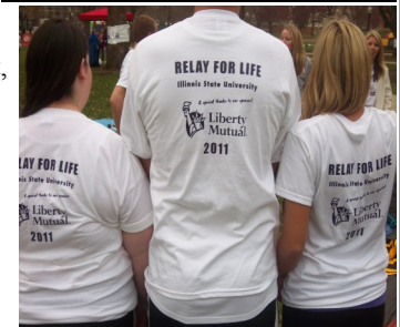
A special thanks to Liberty Mutual

We arrived on the quad around 6pm to get our table set up and to get ready for the night. We had a great time out there as we came prepared with our bags set, Frisbee, football, baseball and gloves. These were all excellent ways to not only have fun with each other, but also a great way to get those walking the path to stop by for a while.