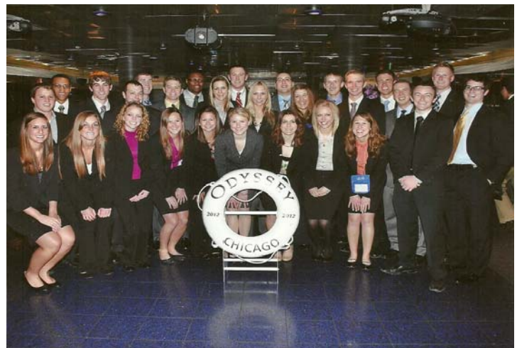
2012 ISU NAPSLO Attendees