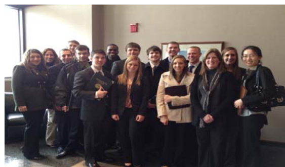
Gamma Students Visit COUNTRY Financial