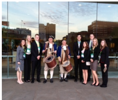
Gamma Students and Drummers Outside AJG Reception in Philly