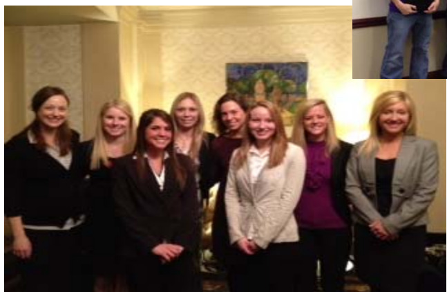
Gamma Students and Alums at Association of Professional Insurance Women Lunch