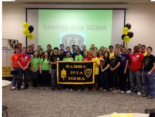
Gamma Games 2012