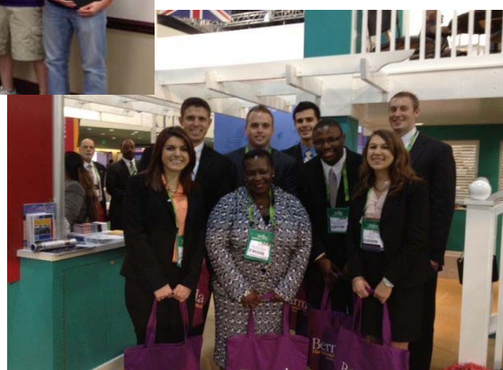
Gamma Students with Bermuda Premier Paula Cox at the Bermuda Booth at RIMS 2012