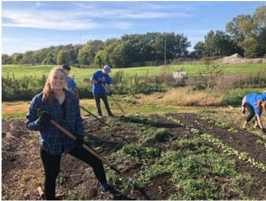
Bloomington Active Garden