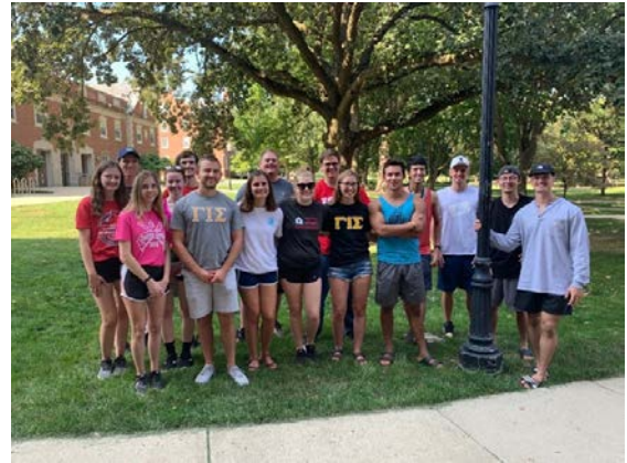
Clean The Quad