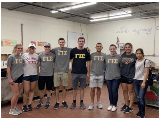
Home Sweet Home Ministries