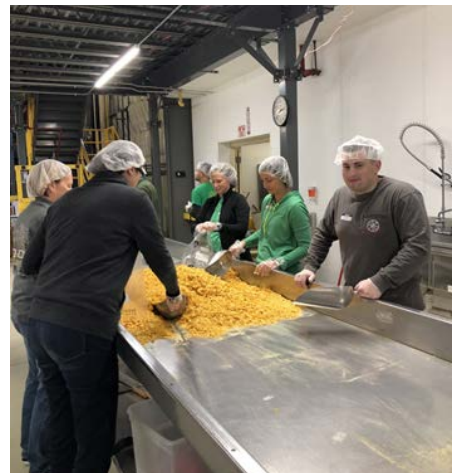
Midwest Food Bank