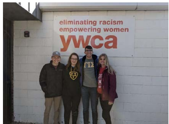
Young Women's Christian Association