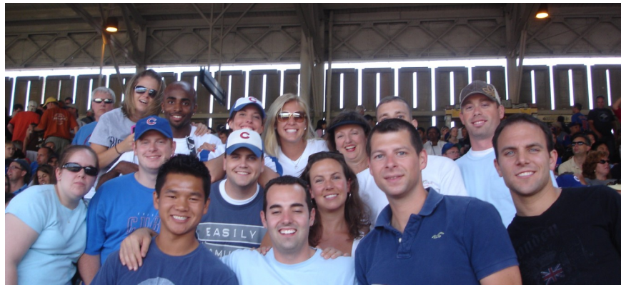
Cubs Game Outing for Katie Alumni