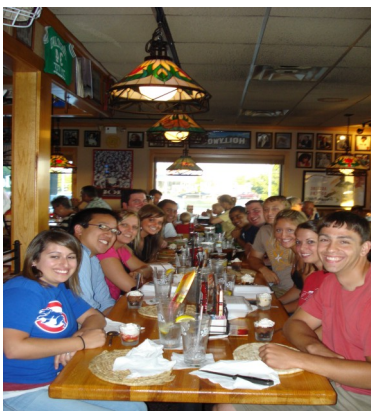
Gamma Iota Sigma officers enjoying dinner during the officer retreat