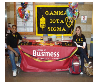
Officers celebrating Gamma's 17th Birthday

The CPCU Expo was an extremely beneficial experience for many of the Katie School students because of its relevance to the insurance field. Simply gaining the knowledge while obtaining a mentor was advantageous towards my career and it happened because of the Expo. Networking has to start somewhere and the CPCU Expo dinner was a great place to start.