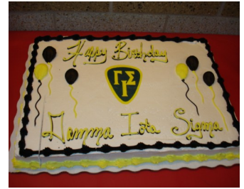
Birthday cake before it was served to students for Gamma's 17th birthday!!!