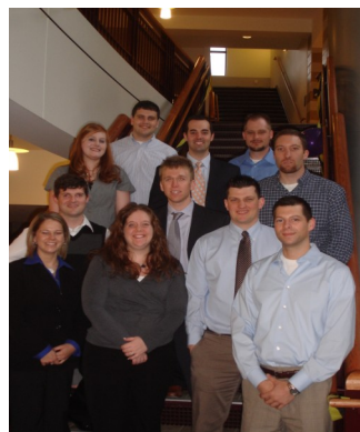
Katie School Alumni at the Gamma Initiation in April 2008