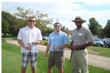
Katie School students and alumni having fun playing golf

This year the Katie School of Insurance hosted its Alumni-Student golf Outing on Friday, October 3 rd . The outing was held at the Illinois State Golf Course, and was followed by a social at the Pub II. 28 Katie School students attended the golf outing, along with 20 Alumni. This year's outing had the biggest turnout of all previ-