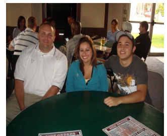
Katie School Alumni and students enjoying refreshments at Pub II