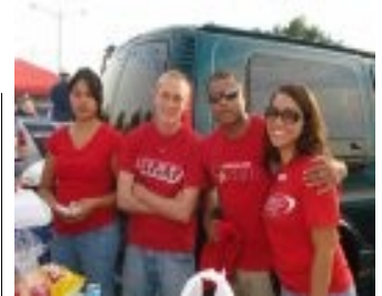
Gamma members enjoying a Saturday tailgate before the football game.