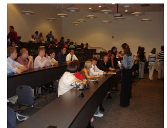
Gamma Iota Sigma officers talking with new members during the new member meeting