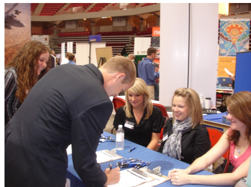
Alumni returning to speak to students at Fall Career Fair