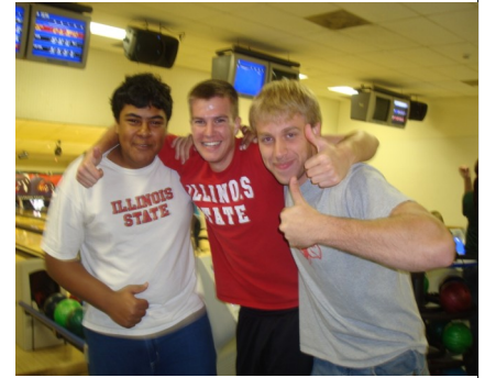
Gamma Underclassmen Social