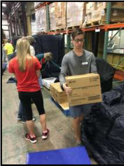
Midwest Food Bank