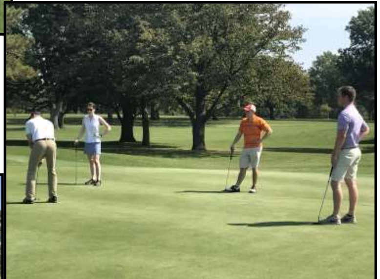
Katie alumni and student on the course