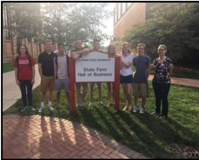
Cleaning the Quad

Members of the Alpha Kappa chapter participated in a wide range of volunteer activities throughout the fall 2017 semester. One of Gamma Iota Sigma's main focuses is on giving back to the community. The Alpha Kappa Chapter focuses on giving back to the community. On average, the Chapter did one volunteer event per week. A few of the activities included volunteering at Home Sweet Home Ministries, working on a house for Habitat for Humanity, and cleaning the quad. Along with local projects, the Alpha Kappa Chapter also participated in the volunteer activity at Gamma Nationals.