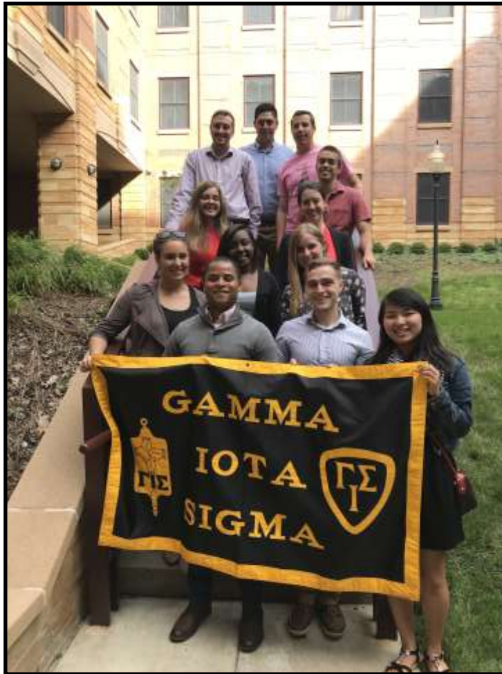
Katie School alumni and students