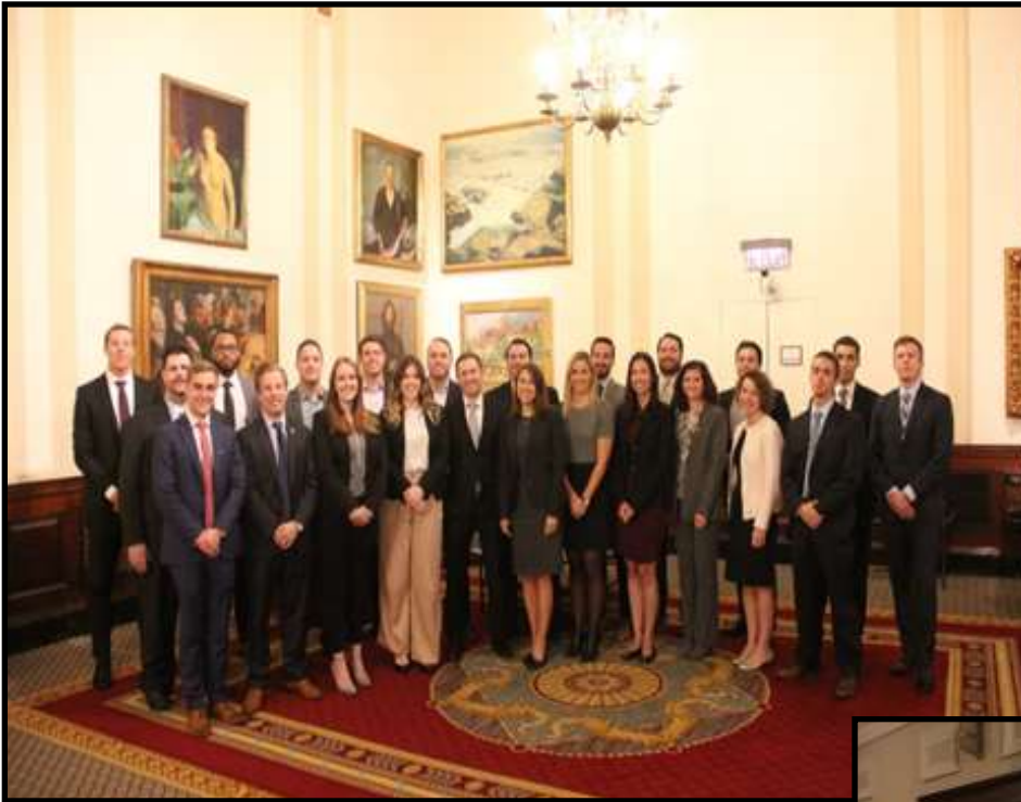
Katie School alumni and students attending the Insurance Executive Forum