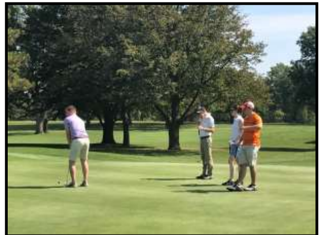
Katie School Alumni Student Golf Outing