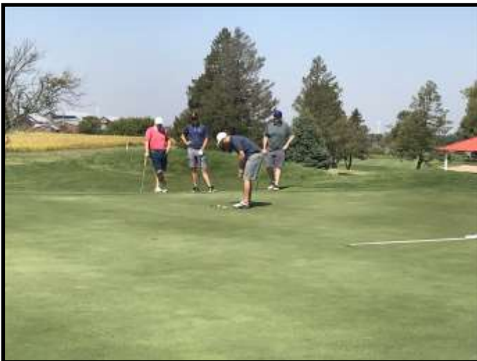
Putting for a birdie!