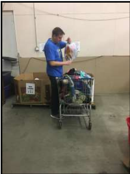
Home Sweet Home Ministries